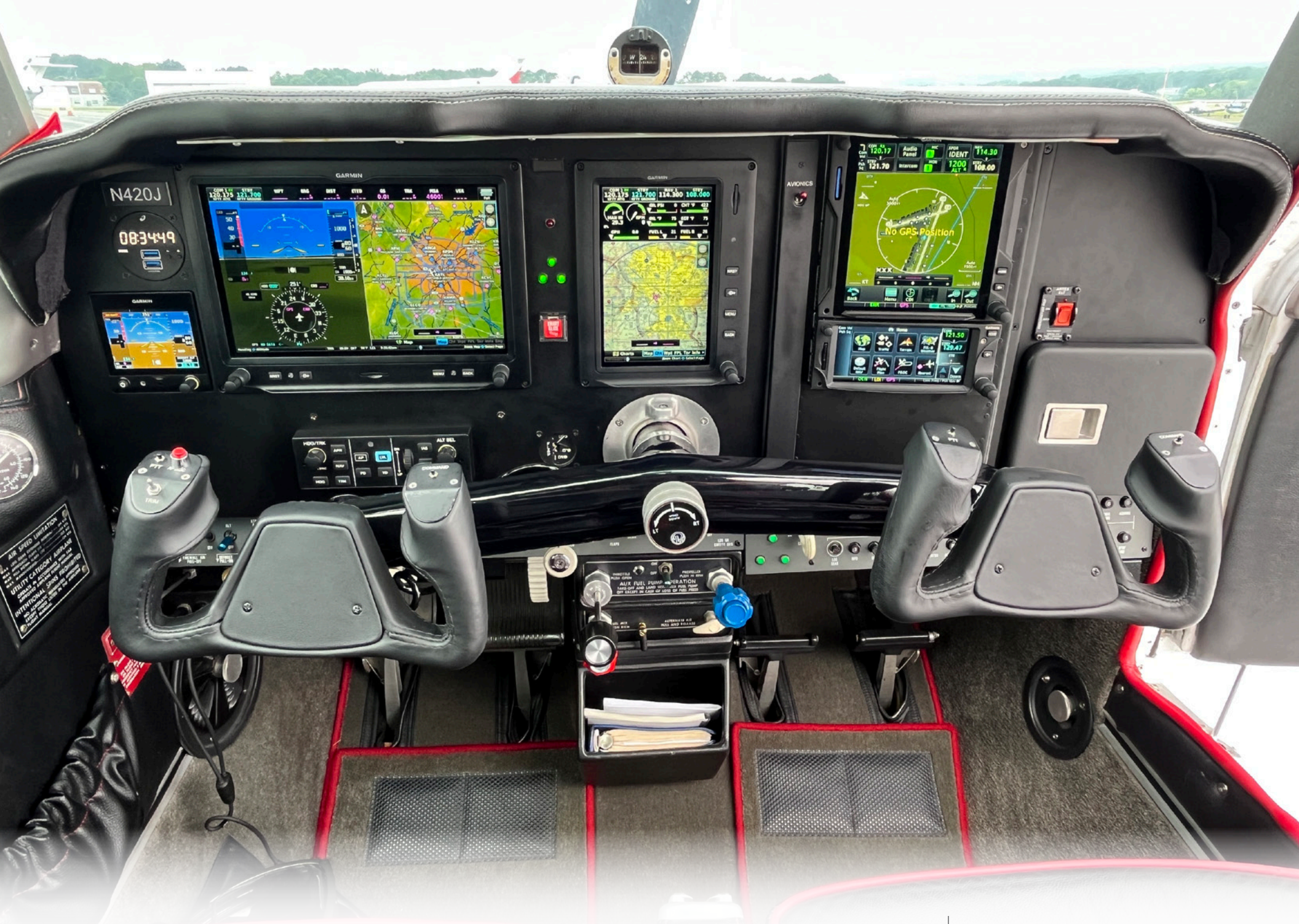
1980 BEECHCRAFT BONANZA F33A SERIAL NUMBER CE-894

WWW.OGARAJETS.COM +1 770 462 7372 | inquiry@ogarajets.com