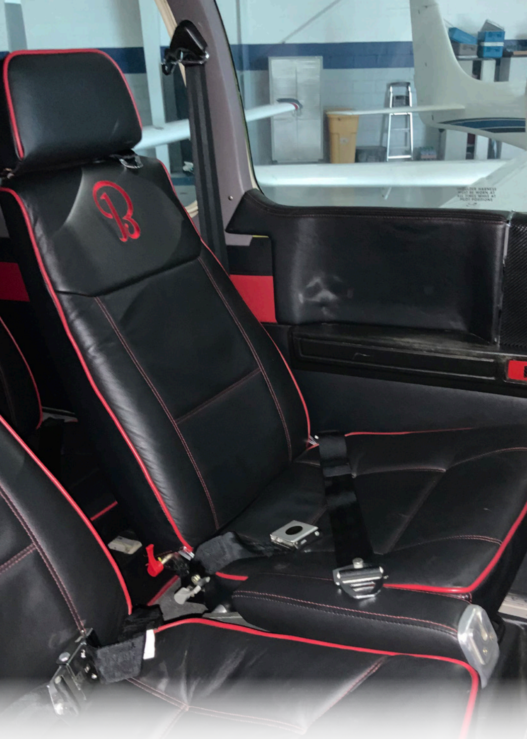
1980 BEECHCRAFT BONANZA F33A SERIAL NUMBER CE-894